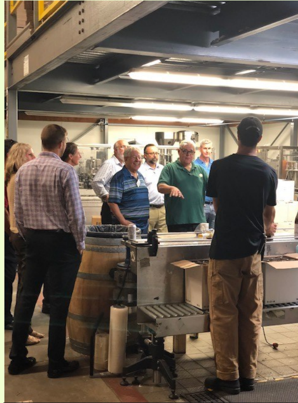
Macari barrels and bottles their wine on site.